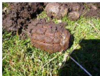
A live grenade

The archaeological dig, which has had the full support of Lochiel, promises to reveal more secrets and artefacts from the Commandos' Training ground in the weeks to come. Meanwhile, there is a DVD on sale at the W H Museum, "The Royal Marines at War" that features the Commandos leaving Spean Bridge Station on their 7 mile march to Achnacarry, their training at the camp and the river behind the Castle, which the Commandos had to cross on ropes with a full pack on their backs.