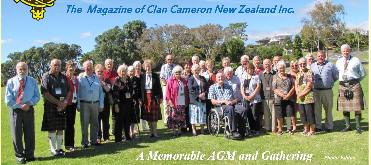
A Memorable AGM and Gathering

The Magazine of Clan Cameron New Zealand Inc.