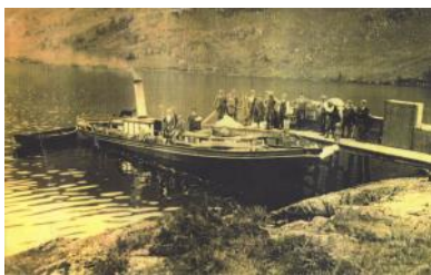
The steam yacht "The Rifle"