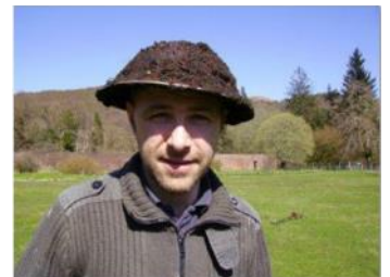
The Tin Helmut

The area under examination is the large field in front of the castle where the camp was set up. In a corner where much unarmed combat took place, other exciting finds have come to light. A tin helmet, made in 1942, was dug up, its padding gone but in remarkably good shape. A cap badge was found, as well as empty shell cases. To the left hand side of the driveway, lying in the rhododendrons - webbing, a wallet and other personal items were discovered. David spoke enthusiastically of results so far and explained: "All the finds will be bagged up and cleaned and then, when the project finishes at the end of August, there will be a display of everything in the West Highland Museum."