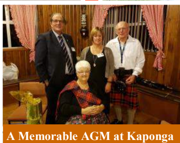
A Memorable AGM at Kaponga