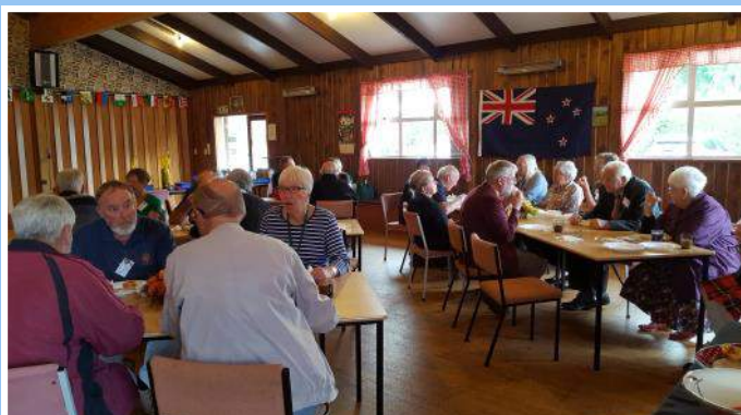
Lunch at the Swiss Clubhouse