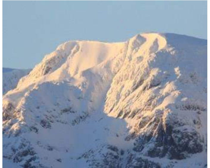
the north face of Ben Nevis

The image (on the cover) shows the pink triangle created as the early morning sun struck Carn Mor Dearg's summit. Mr Cameron had zoomed in for a closer look at the great red peak as the rose-coloured light spread further down the mountain.