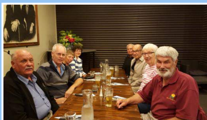
A pleasant evening in Hawera before the AGM.