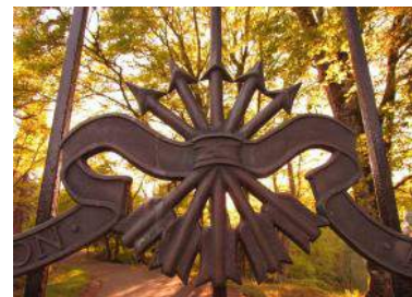
The gate at Achnacarry