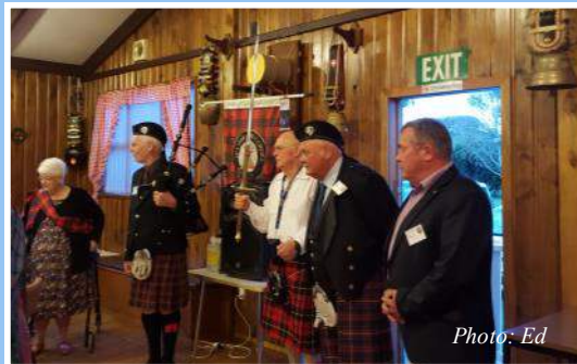
The Haggis party - who will do the honours?

To quote Robbie Burns "The best laid schemes o' mice an' men gang aft agley"