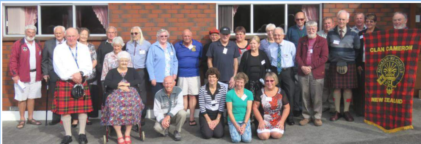
A group photograph taken after the AGM.