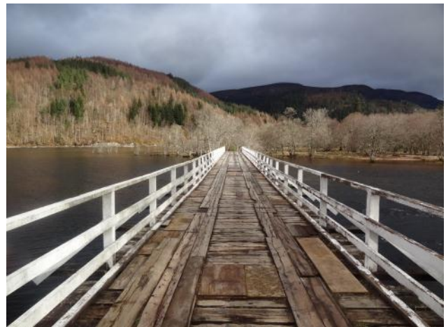
The white bridge at Achnacarry where Loch Arkaig flows into the river Arkaig.

Sadly during some of the wildest winter storms to hit the area at the beginning of this year, the small school building was flattened by gale force winds running through this remote part of Lochaber. Although constructed of a timber frame and adjoining corrugated metal, the building had withstood the rigours of the west highland climate and was a unique example of simple Highland architecture.