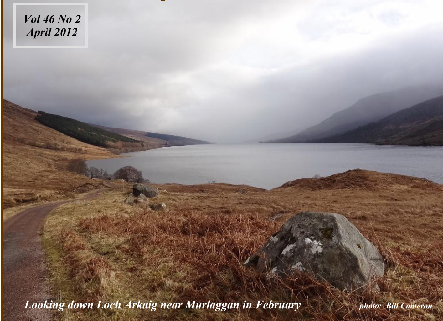
Looking down Loch Arkaig near Murlaggan in February