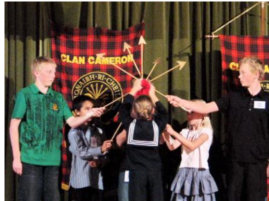
The arrows (one arrow has slipped)