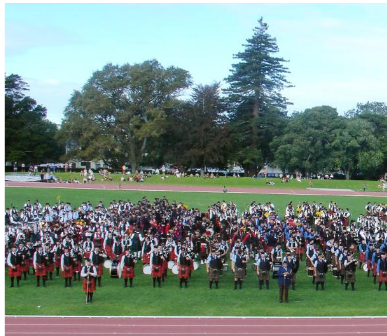
The massed bands parade to complete the National Pipe Band Cha