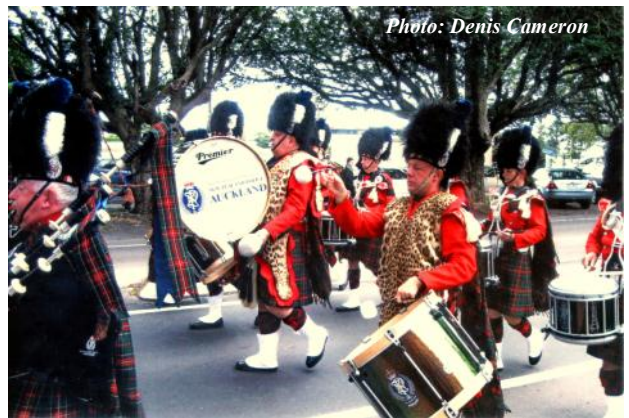
New Zealand Police Pipe Band in the street march