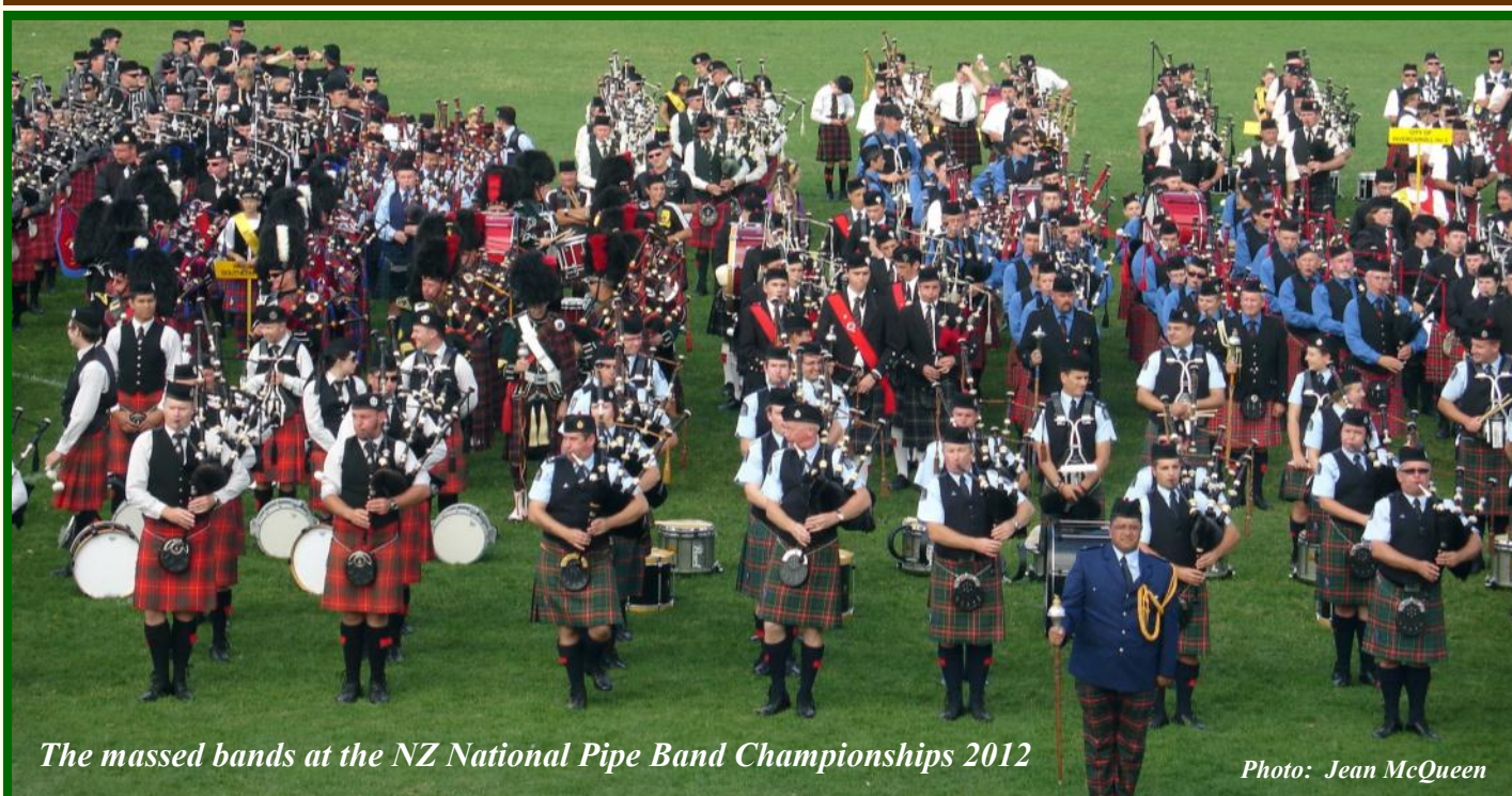
The massed bands at the NZ National Pipe Band Championships 2012