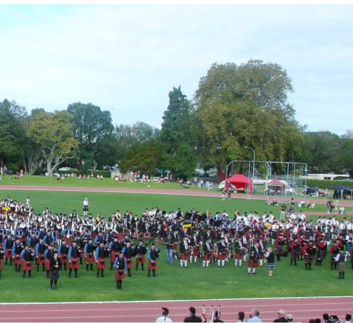
Championships at Tauranga.