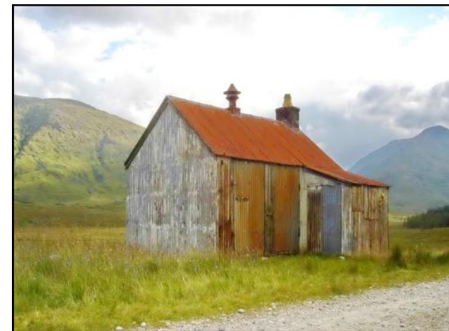
Strathan School - before and after the winter storms