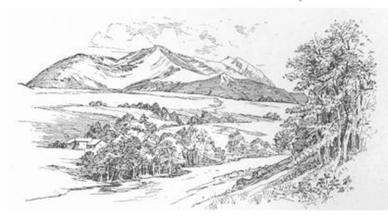
Braes of Lochaber from near Spean Bridge

With thanks to 'The Braes' newsletter of Lochaber for the above two articles.