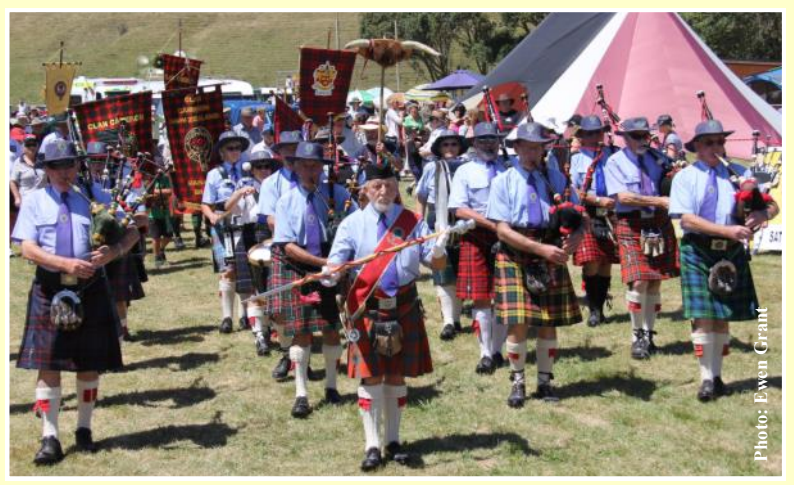
The Clan March at Turakina, lead by the Camerons and Grants.